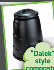
"Dalek" style composter