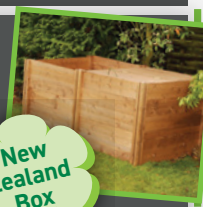
New Zealand Box

Can be made for free or bought for £50 approx